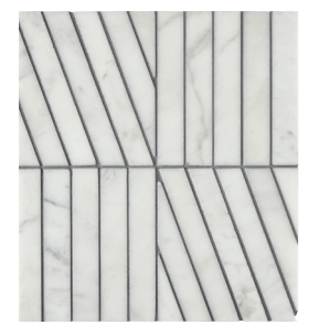
ZigZag Blanc Honed Mesh

ZIGZAG BLANC HONED MESH Calacatta Gris Honed ZIGZAG BLANC/LUNA HONED MESH Calacatta Gris Honed/Terra Luna Honed ZIGZAG CREMA/SKY HONED MESH Terra Nova Honed/Skyline Honed ZIGZAG NOIR/BLANC HONED MESH Black Honed/Calacatta Gris Honed