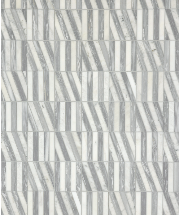
ZigZag Blanc/Luna Honed Mesh