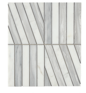
ZigZag Blanc/Luna Honed Mesh