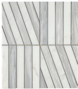
ZigZag Blanc/Luna Honed Mesh