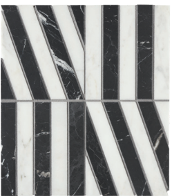
ZigZag Noir/Blanc Honed Mesh

ZigZag is one of our newest Stone Mesh Patterns. The pattern is a combination of straight and angled pieces which gives it an illusion of movement like a cascading waterfall.