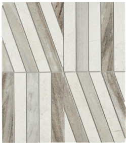
ZigZag Crema/Sky Honed Mesh