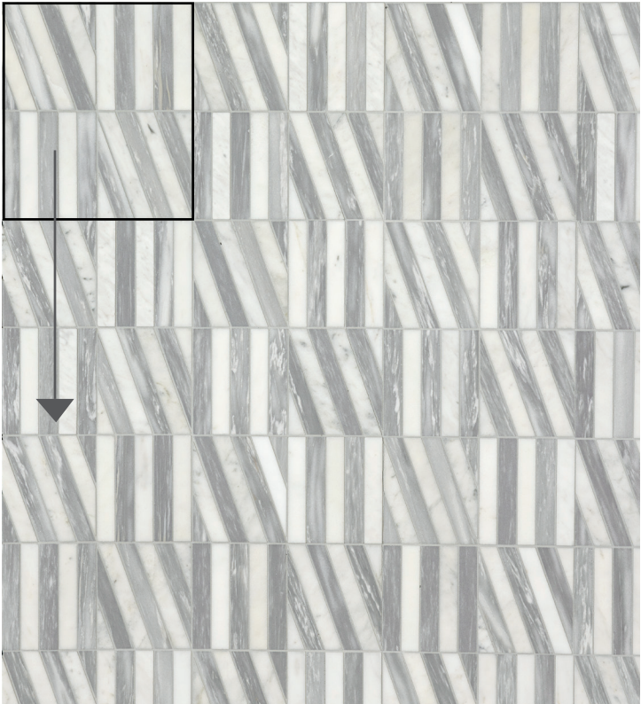
ZigZag Blanc/Luna Honed Mesh