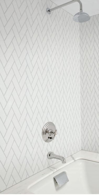
Geo 2-Harmonie Bridge