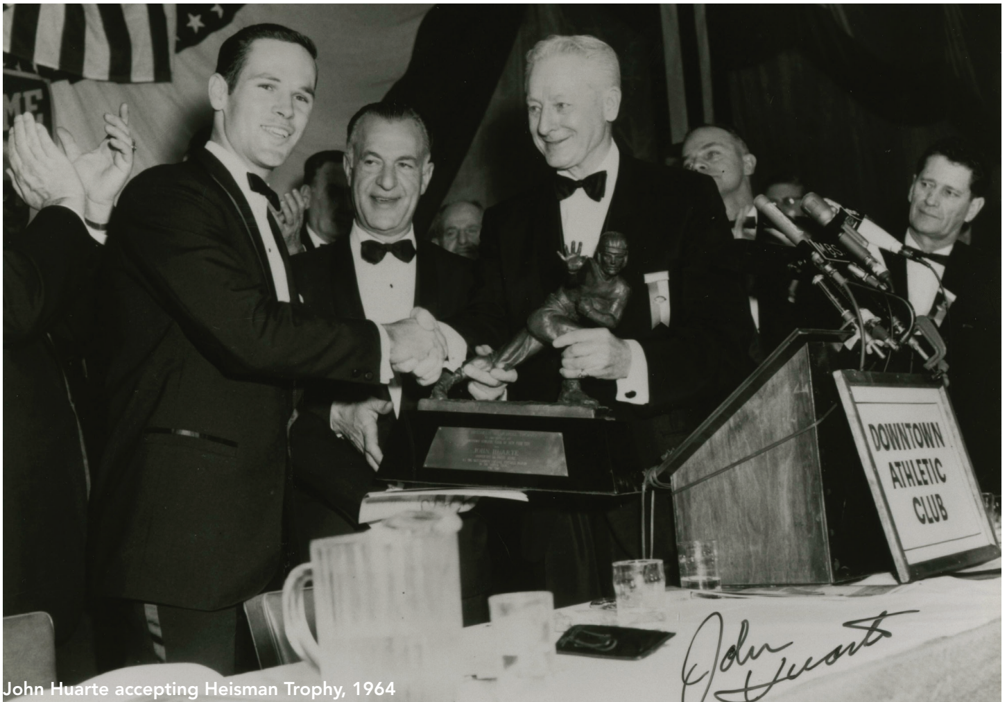
John Huarte accepting Heisman Trophy, 1964