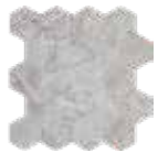
Themar Grigio Savoia Hex 2-3/8