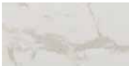
Themar Venato Gold