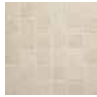
Themar Crema Marfil 2 x 2