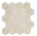
Themar Crema Marfil Hex 2-3/8