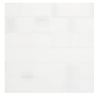
Themar Bianco Lasa 2 x 2