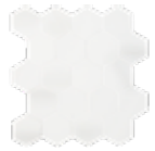
Themar Bianco Lasa Hex 2-3/8