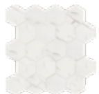
Themar Statuario V Hex 2-3/8