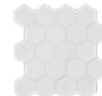
Themar Venato Gold Hex 2-3/8