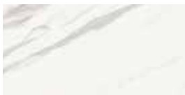
Themar Statuario V