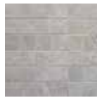
Themar Grigio Savoia 2 x 2