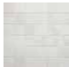
Themar Venato Gold 2 x 2