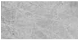
Themar Grigio Savoia