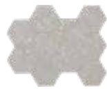
4 Inch Hex Mesh