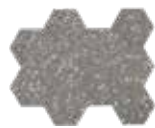
4 Inch Hex Mesh