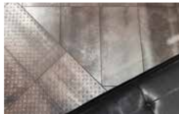
Stage Red & Stage Red Boss

For proper bonding, LHT/LFT mortar for large format and heavy tiles should be used when installing tiles with a dimensional length greater than 15" and rectangular shape and plank tile, per industry standards. Proper thinset coverage is also necessary, and in some cases, back buttering of tile may be required.