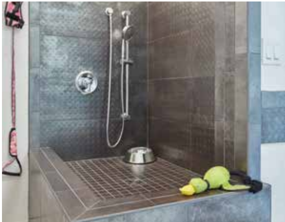
Stage Grey and Stage Grey Boss