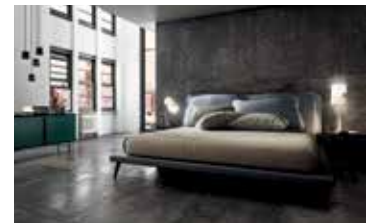
Stage Grey & Stage Grey Boss