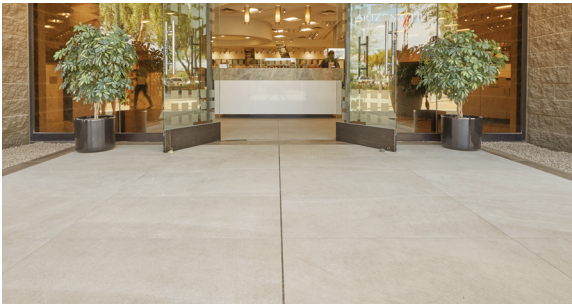
Pietra Italia Beige 24 × 48 R11 Anti-Slip Finish