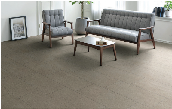
Pave Moka 12 × 24