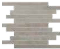
1 x 12 Stagger Stack