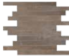
1"x12" Stagger Stack