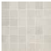
2 x 2 Mosaic