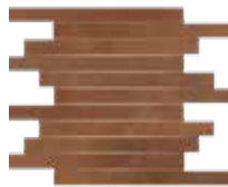
1 x 12 Stagger Stack