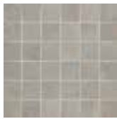
2 x 2 Mosaic