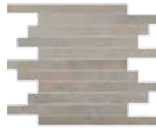
1"x12" Stagger Stack