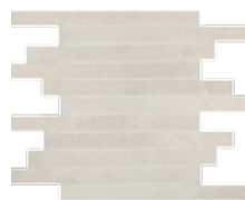
1"x12" Stagger Stack