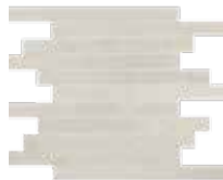
1 x 12 Stagger Stack