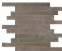
1 x 12 Stagger Stack