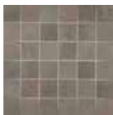
2 x 2 Mosaic