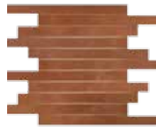
1"x12" Stagger Stack