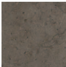
Eternal Limestones Anthracite