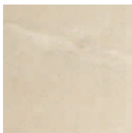
Eternal Limestones Bianco

PRODUCT TYPE Rectified Color Body Porcelain