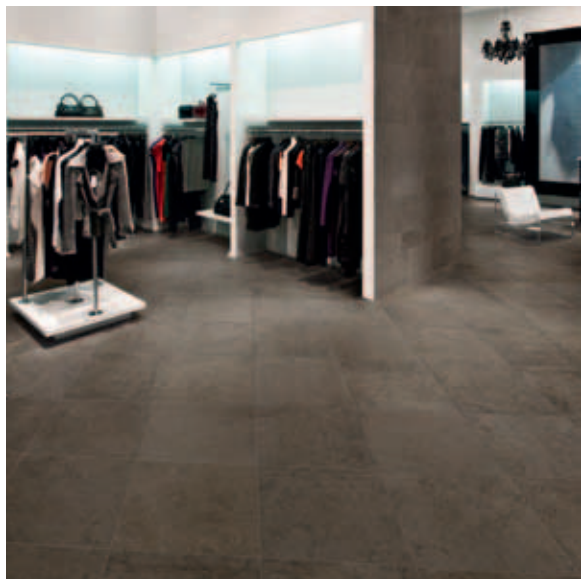
Eternal Limestones Anthracite