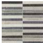
Blend Straight Stack