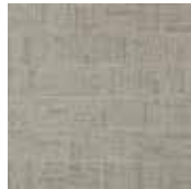
Ecu 2 x 2 Mosaic