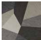
Digitalart Mix Deco