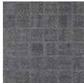
Denim 2 x 2 Mosaic