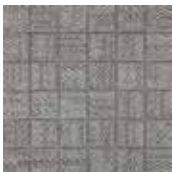
Grey 2 x 2 Mosaic