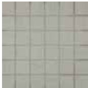
Bianco 2 x 2 Mosaic