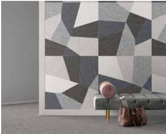
Digitalart Mix Deco & Digitalart Grey