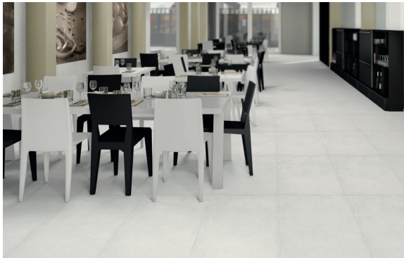
Cemento Rasato Bianco