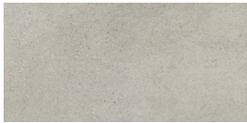
Cemento Rasato Grigio