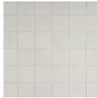
Cemento Rasato Bianco 2 x 2 Mosaic Mesh