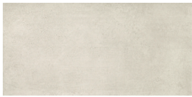
Cemento Rasato Beige