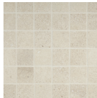
Cemento Rasato Beige 2 x 2 Mosaic Mesh