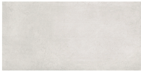
Cemento Rasato Bianco