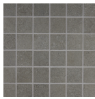
Cemento Rasato Antracite 2 x 2 Mosaic Mesh