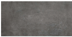
Cemento Rasato Antracite