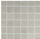
Cemento Rasato Grigio 2 x 2 Mosaic Mesh

When installing rectangular or square tiles 15 inches or longer with a staggered joint, it is recommended that the offset should not exceed 33%, unless otherwise specified by the manufacturer.