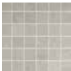
Cemento Rasato Grigio 2 x 2 Mosaic