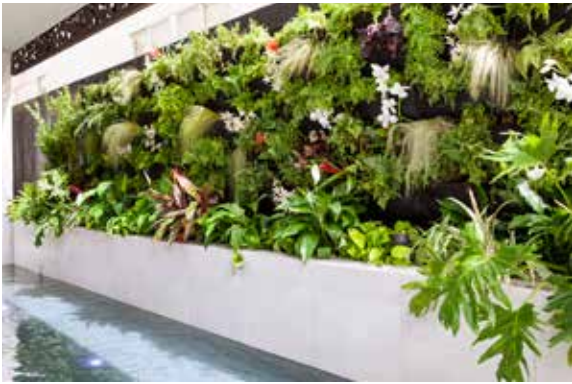
Cemento Rasato Bianco