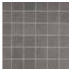
Cemento Rasato Antracite 2 x 2 Mosaic