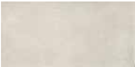
Cemento Rasato Beige