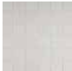
Cemento Rasato Bianco 2 x 2 Mosaic