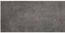
Cemento Rasato Antracite