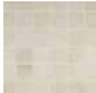
Cemento Rasato Beige 2 x 2 Mosaic