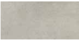
Cemento Rasato Grigio