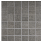
Cemento Cassero Antracite 2 x 2 Mosaic Mesh