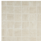
Cemento Cassero Beige 2 x 2 Mosaic Mesh