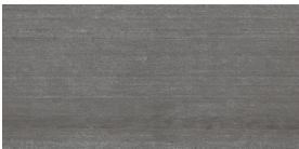
Cemento Cassero Antracite