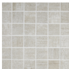
Cemento Cassero Grigio 2 x 2 Mosaic Mesh