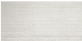
Cemento Cassero Bianco