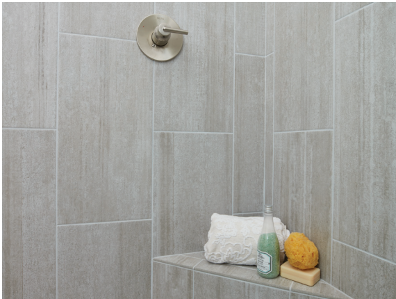
Cemento Cassero Grigio