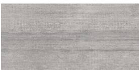
Cemento Cassero Grigio