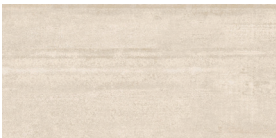
Cemento Cassero Beige