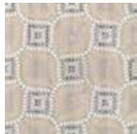
Cementine Evo 3