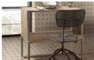
Cementine Evo 2