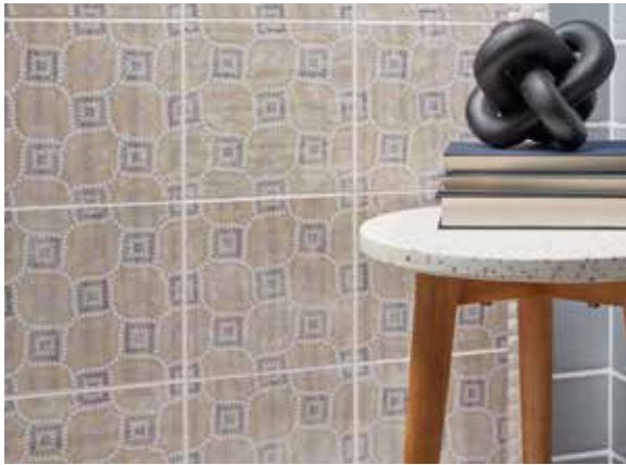
Cementine Evo 3