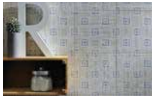
Cementine Evo 3