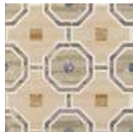
Cementine Evo 2