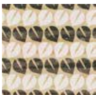
Cementine Evo 5