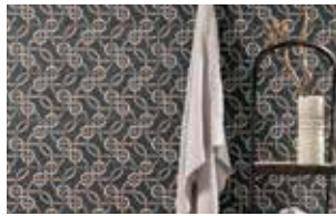
Cementine Evo 1