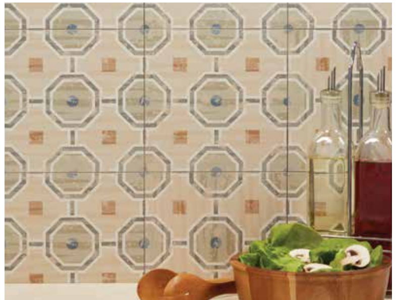
Cementine Evo 2

The Cementine Evo Series is a porcelain, inspired by the fabrics of the 60's, 70's and 80's. The graphics provide a strong, visual impact, using flat background colors to create simple, essential forms. The tile has the appearance of a stencil, worn by time. It is available in five, designs that allow for great variety in how they can be used. Whether using them as individual accents, creating a group of one design, or mixing multiple designs together, they can be used to create a unique layout.