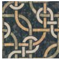
Cementine Evo 1