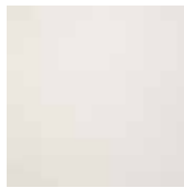
Arch Light Ivory