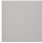
Arch Cool Grey