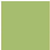
Arch Acid Green