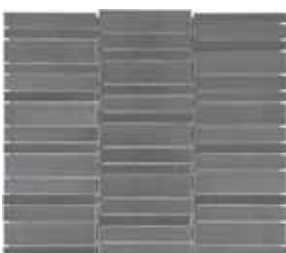
Stainless Steel Random Stacked Mosaics