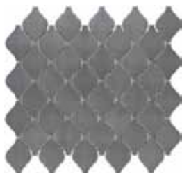
Stainless Steel Arabesque Mosaics