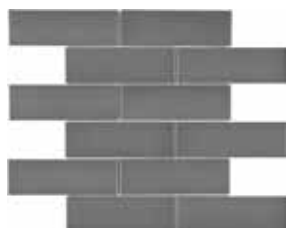
Stainless Steel 2"x6" Brick Mosaics