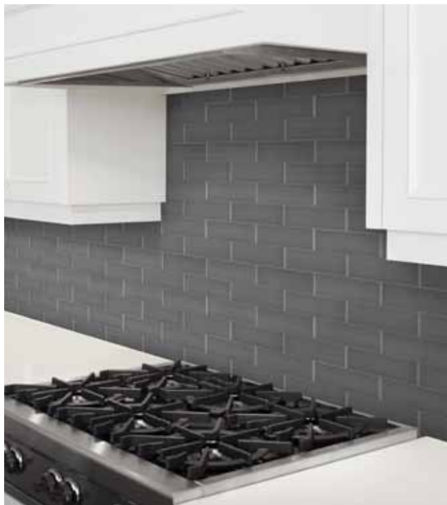
Stainless Steel 2"x6" Brick Mosaics