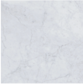
12 x 12 x 3/8" (H & P)