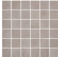
2 × 2 Mosaic Mesh