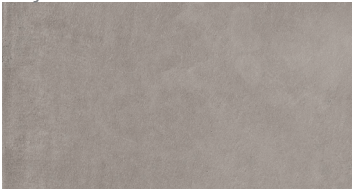
12 × 24