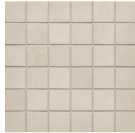
2 × 2 Mosaic Mesh