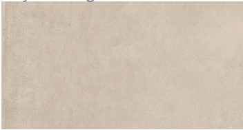
12 × 24