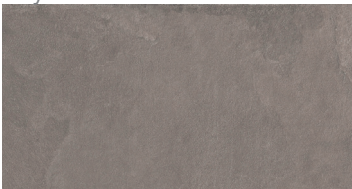
12 × 24