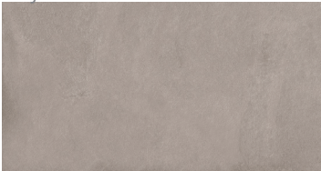
12 × 24