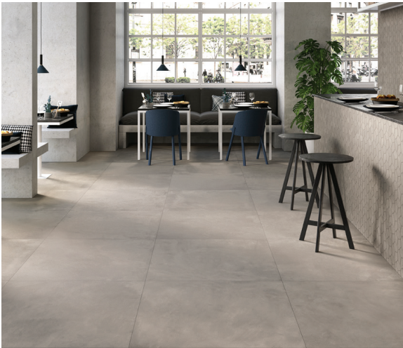
CityLife Ash 36 × 36